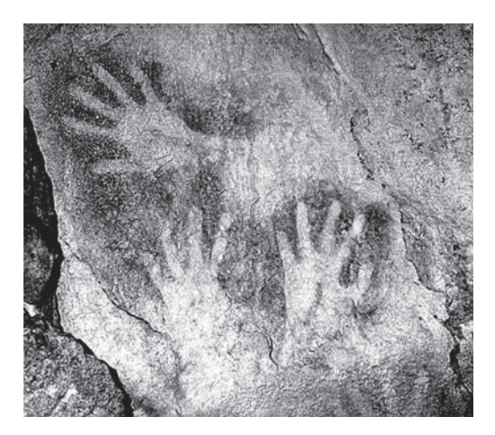
Fig. 2 - Hand stencils from Gua Masri, Kalimantan, Borneo.

From the collections of hand prints/stencils where it has been possible to assign the hand used to make the image, it would appear that the overwhelming majority suggests a right hand dominance. The reported frequencies hand stencils and prints in Europe, Australia, the Americas, and Borneo show statistically significant departures from 50% (p< 0.01) in all cases (detailed in Steele and Uomini, 2005). The universality of these proportions is consistent with a righthanded pattern. In experimental cave painting, right-handers prefer to make stencils by pressing their left hand against the wall (C. Gilabert, pers. comm.), especially when spraying pigment through a tube held in the right hand (Faurie & Raymond, 2004). The left-hand stencil preference may reflect a postural bias to standing on the left leg (Auerbach & Ruff, 2006), or it may be constrained by a preference to hold the pigment container, torch, or blowing tube in the right hand. Conversely, the right-hand print preference may be related to a more direct link with the hand used to paint cave art when the pigment is applied with fingers, which would indicate a right-hand dominance for drawing in