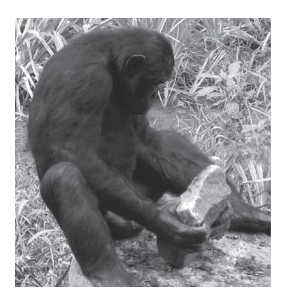
Fig. 3 - A bonobo (Pan paniscus) cracking nuts. Lola Ya Bonobo Sanctuary, D.R. Congo.

The majority of studies on tool-use have focused on chimpanzees. These studies are reviewed in McGrew & Marchant (1997b) and Marchant & McGrew (2007). They reported a strong laterality for tool-use (Marchant et al. , 1999, but with the exception of Marchant & McGrew, 2007). Wild chimpanzees have been found to exhibit strong individual preferences for the use of a probe to extract termites from their nests (termite fishing) (Nishida & Hiraiwa, 1982; McGrew & Marchant, 1992; Marchant & McGrew, 1996; McGrew & Marchant, 1999; Lonsdorf & Hopkins, 2005), to use a 'sponge' to drink water from tree holes